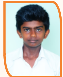
ABIN B S