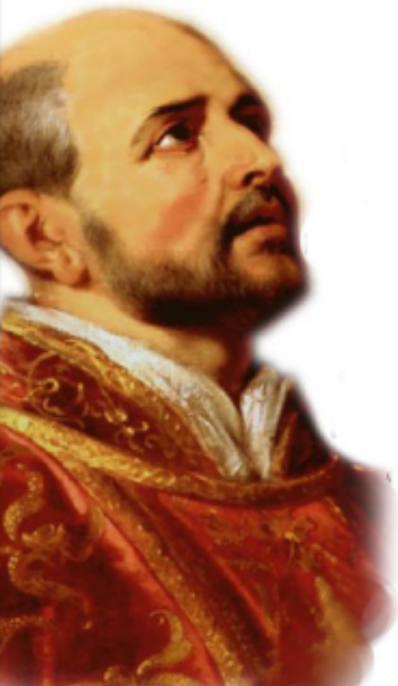
ST IGNATIUS OF LOYOLA OUR PATRON SAINT & THE FOUNDER OF THE JESUITS

Magis is a quite familiar and popular word in the Jesuit circles. This word is repeatedly used in Jesuit High Schools, Colleges and Universities. I often hear the students at Loyola School end their public speeches with this magical word. Why do many of the Jesuit institutions use this inspirational word as their motto?